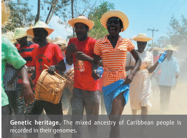
Genetic heritage. The mixed ancestry of Caribbean people is recorded in their genomes.

The comparisons suggest that the Caribbean's original settlers came from the Ori-